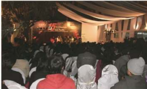
Celebration of 15 years of Dept. of Architecture