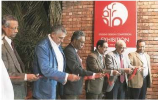
Inauguration of Design Exhibition at Department of Architecture, UAP