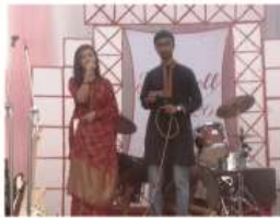
Farewell Program at Dept. of Pharmacy