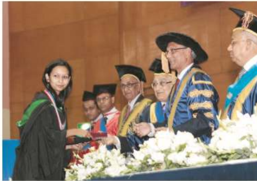
A Chancellor's Gold Medalist student receiving crest from Hon'ble Education Minister Mr. Nurul Islam Nahid MP