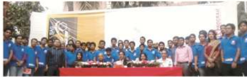
Farewell Program, Dept. of CE CE Farewell Program FALL-2012