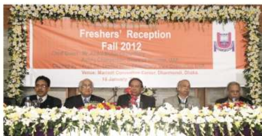
UAP Freshers' Reception, Fall 2012