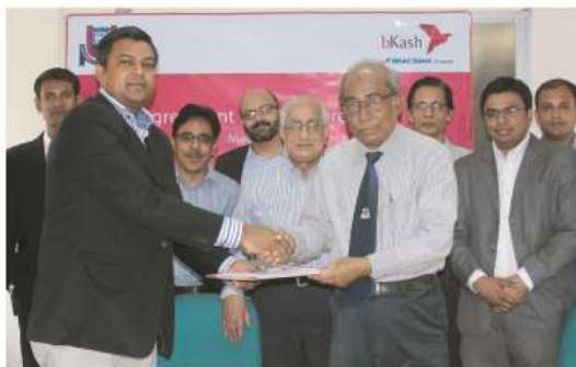
Signing of MoU between UAP and bKash