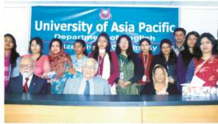
Prize Giving Ceremony at Dept. of English